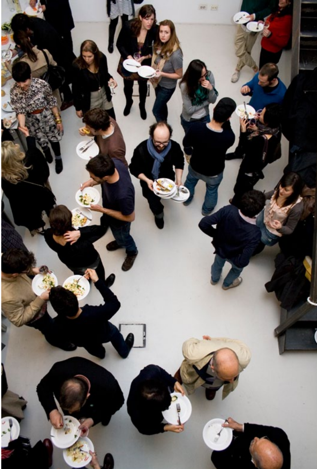
An exceptional private dinner, cooked in authentic Italian style by the Apartamento team marked the opening of FoodMarketeto.