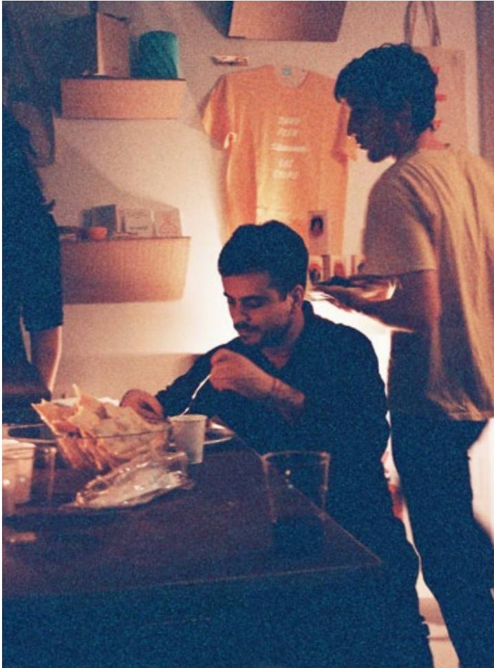
A private dinner for FoodMarketeto contributors!